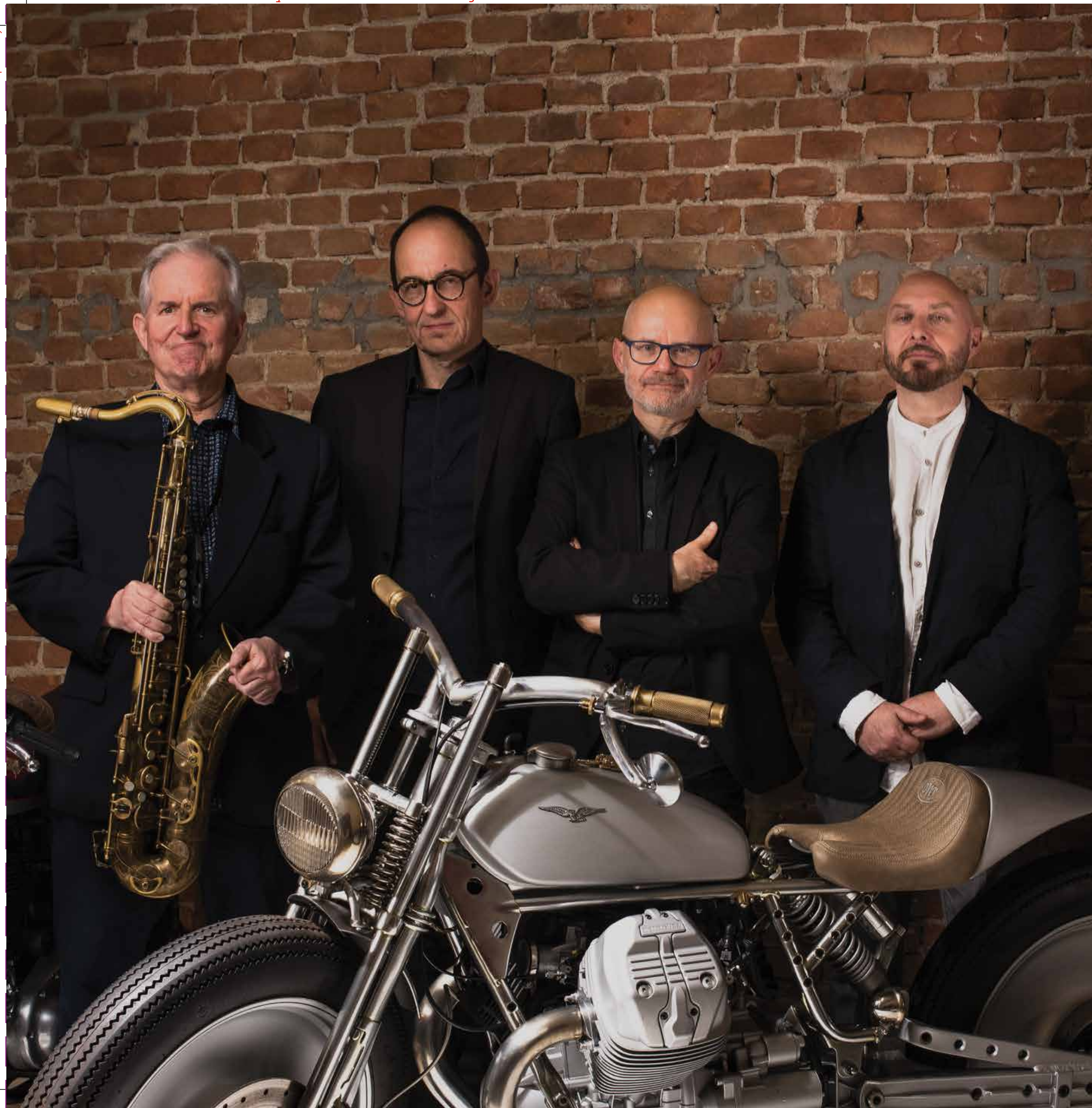
Left Inside Panel